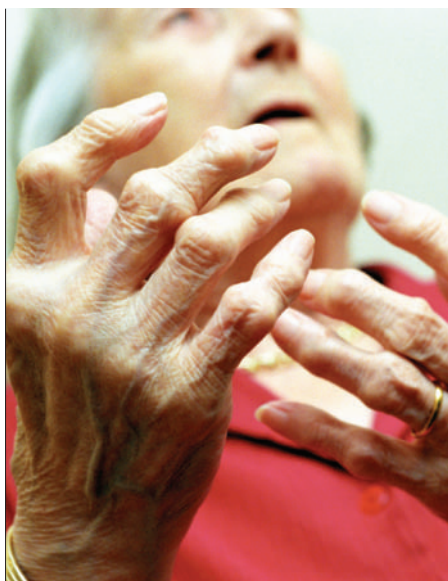
Stiff drink: joints can become painful and inflamed in old age as the cartilage breaks down, but leeches ease the symptoms of osteoarthritis.