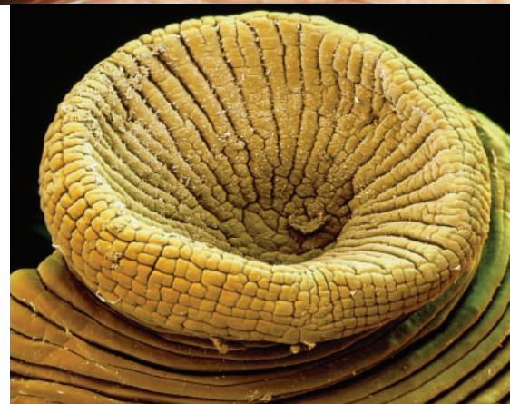
Blood vessels: leeches attach themselves by suckers (above) and can drink ten times their own body weight in blood.

As modern medicine developed, the tiny blood-suckers fell from favour until the 1960s, when physicians realized their potential to aid vascular surgery. During an operation, it can be hard to rejoin ruptured veins. Without functional vessels to drain blood away, tissue can be deprived of oxygen, causing cells to die. Leeches suck this excess fluid away, buying the body time to re-establish its own network of blood vessels. An astounding 80% of Britain's 62