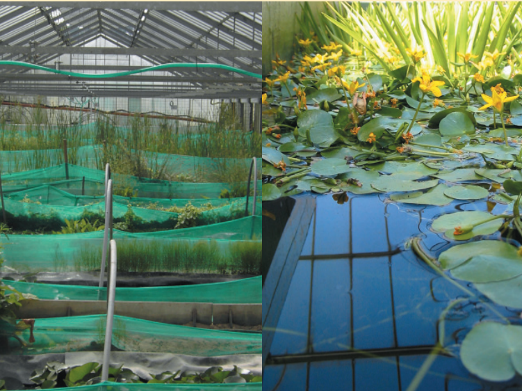
A view of one of Biebertaler Blutegelzucht's ponds recreate as nearly as possible the leech's natural environment, important for the care and breeding of leeches which are to meet the high quality standards required of leech therapy.

Medicinal leeches have been categorized as a medicinal product and are as such subject to the same safety, quality and efficacy requirements as apply to all forms of licensed medication.